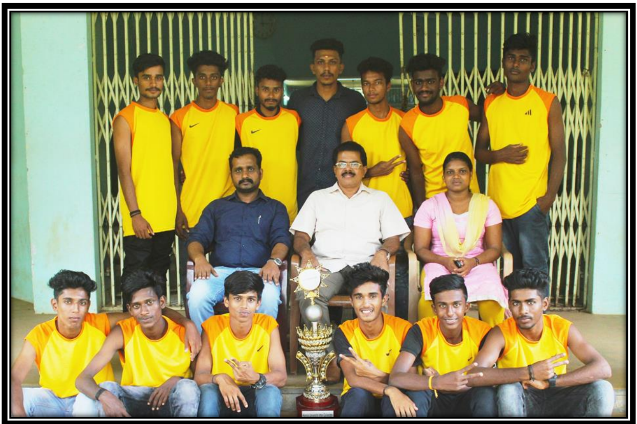
S N College, Varkala Kho Kho Men team lifted Kerala university inter collegiate Kho Kho Men runner up trophy posing with college Principal and physical education Teachers on 17th and 18th September 2018