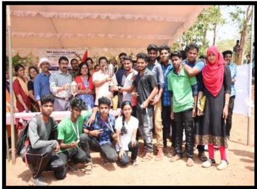
Runner up- B.Com Finance – during Annual Athletic Meet on 16th March 2019