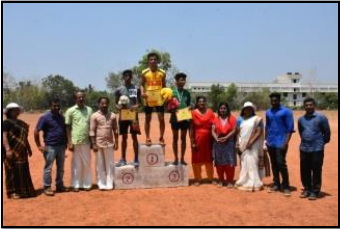
victory ceremony during Annual Athletic Meet on 16th March 2019

Various competitions were conducted for teaching and non-teaching staff.