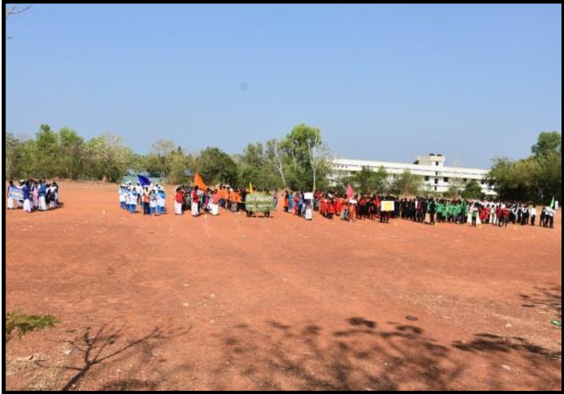
march past teams positioned during Annual Athletic Meet on 16th March 2019