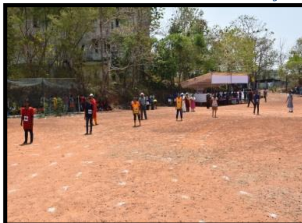
400m race during Annual Athletic Meet on 16th March 2019