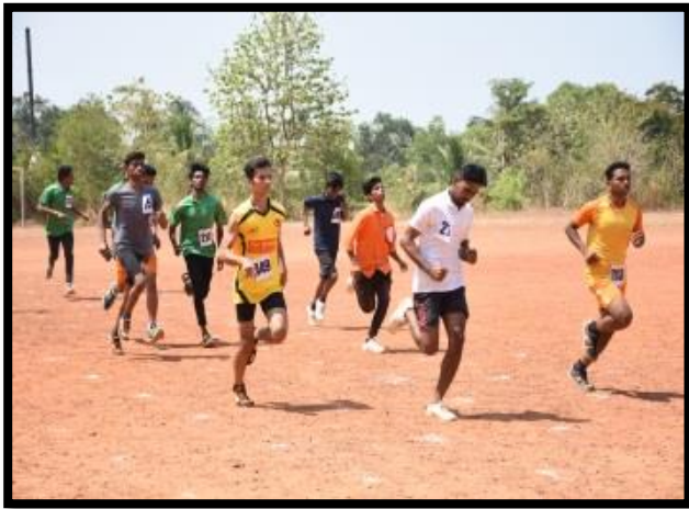
1500m race during Annual Athletic Meet on 16th March 2019