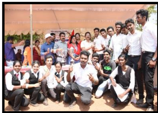
II Runner up -B.com Hotel – Annual Athletic Meet on 16th March 2019