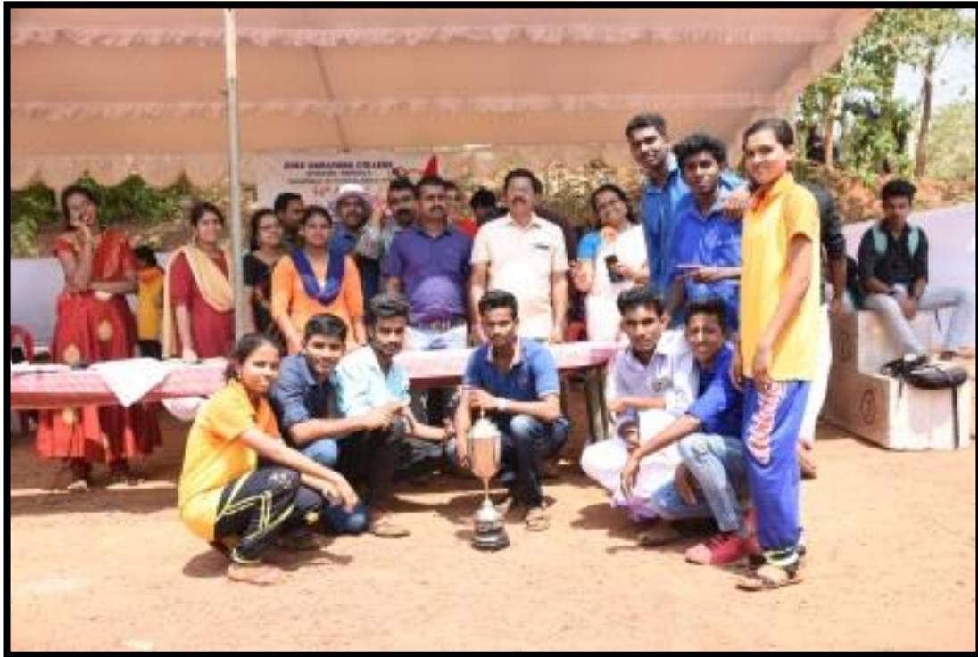
Winner -Malayalam department- Annual Athletic Meet on 16th March 2019