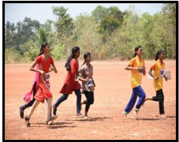
800m race during Annual Athletic Meet on 16th March 2019